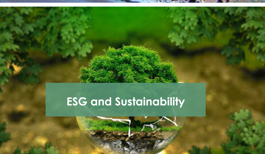
ESG and Sustainability