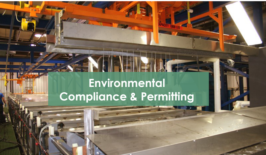
Environmental Compliance & Permitting