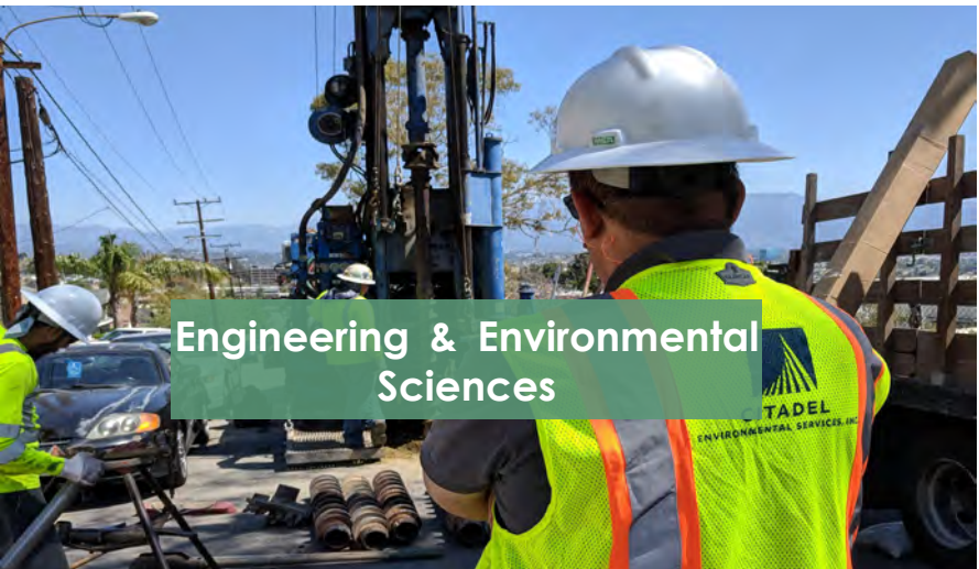
Engineering & Environmental Sciences