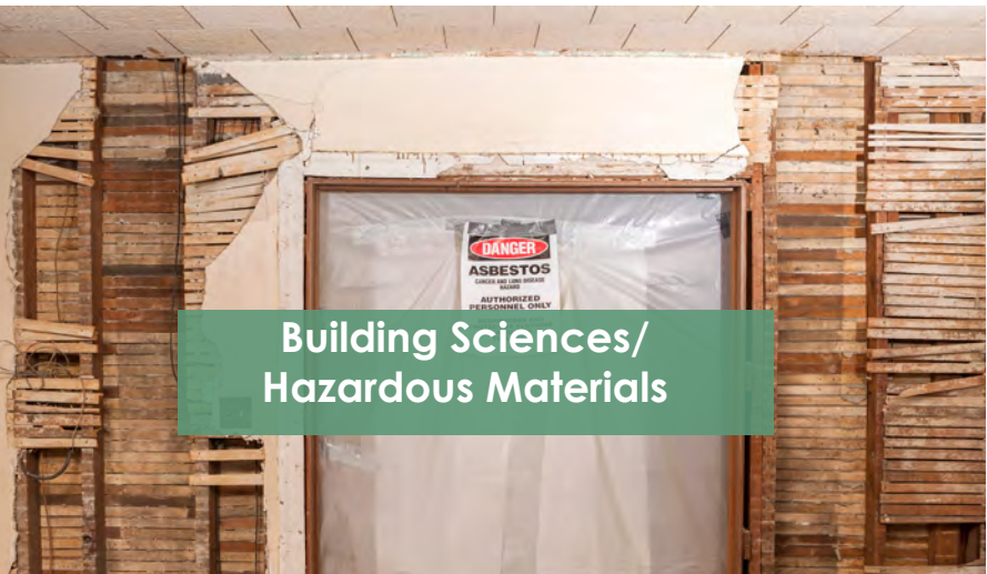
Building Sciences/ Hazardous Materials